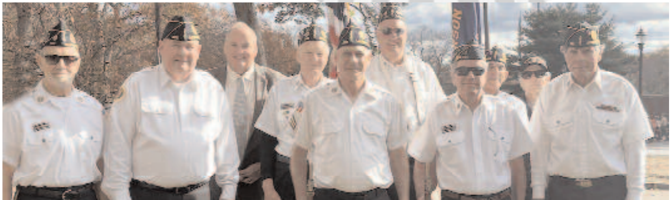
Members of the Post attended a Veterans Day ceremony at the Quincy World War Two memorial