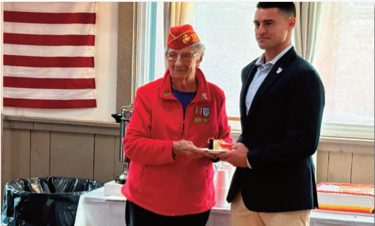
The Post Hosted the Marine Corp Birthday Celebration on November 10th. Here the birthday cake is cut by the oldest and youngest marine.