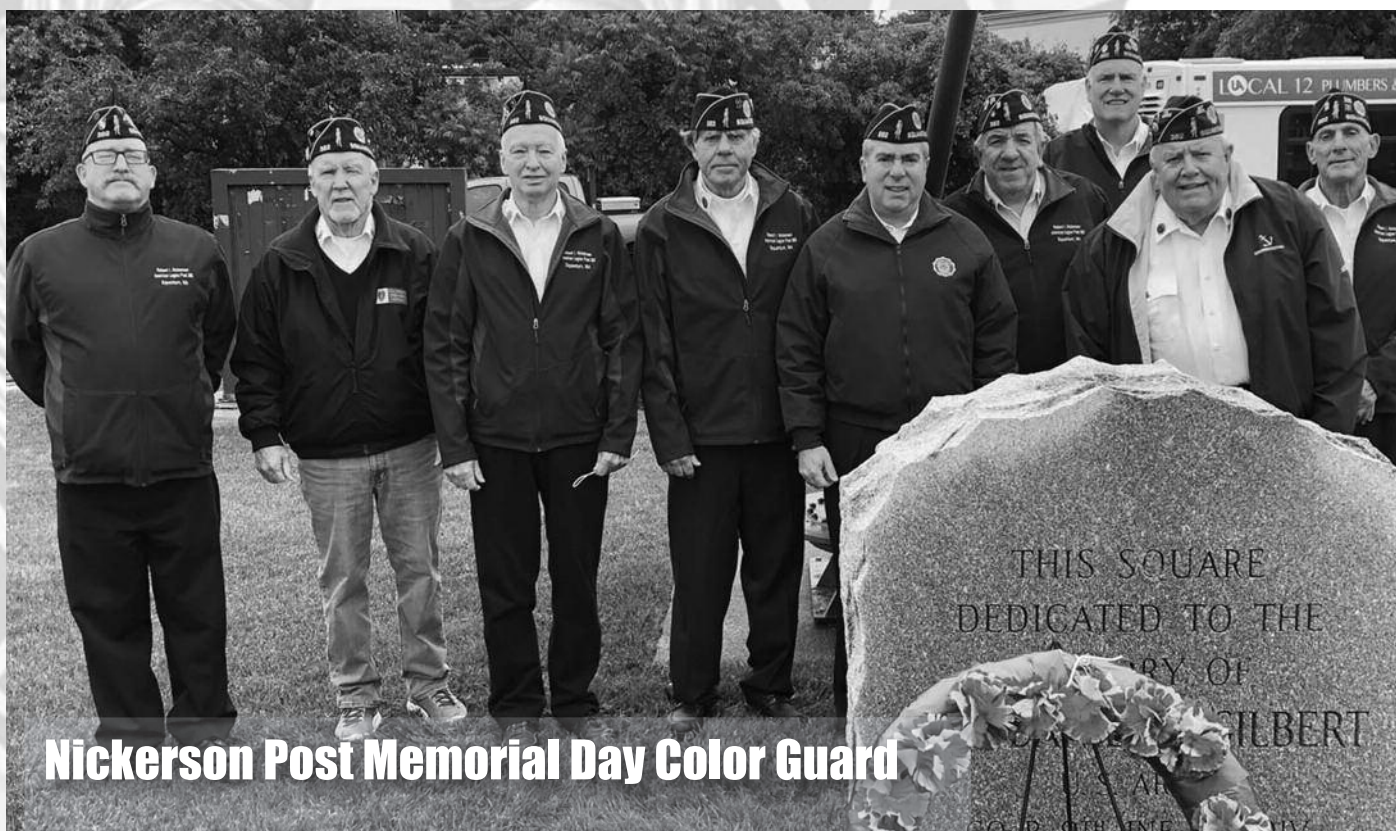
Nickerson Post Memorial Day Color Guard