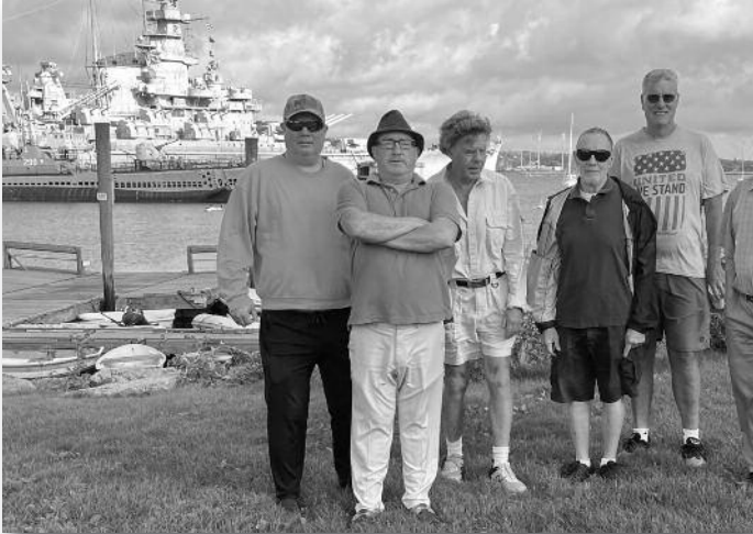
Recently, a group of Post members bussed down to Battleship Cove to tour the USS MASSACHUSETTS, along with a submarine and 3 other ships, boats and displays. The crew also lunched aboard 'BIG MAMIE'

OUR NEWSLETTER -To save on mailing costs in the future, we hope to have as many people as possible receive the newsletter by email. This will also be helpful for any announcements between issues. Please visit our website, nickersonpost.com , to enter your email.