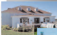
Cape Cod Canal Visitors Center