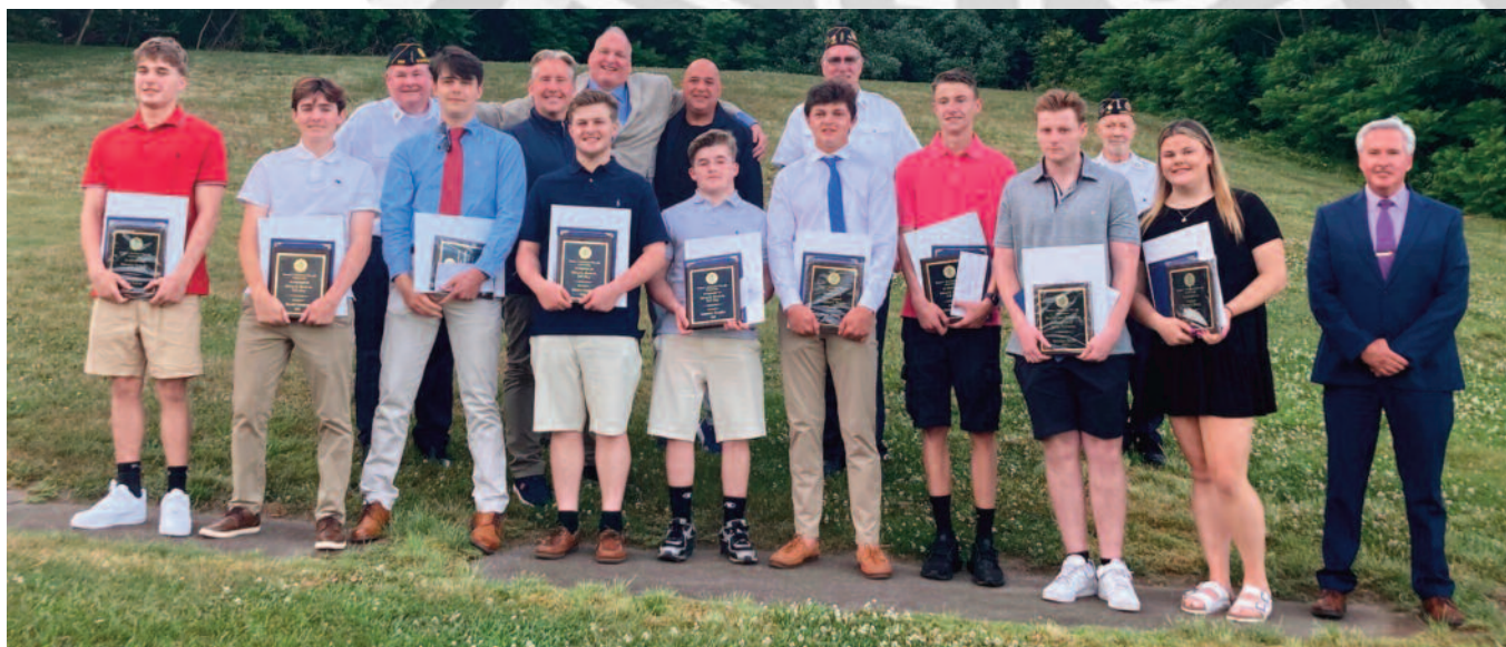
The Scholarship recipients and members of Nickerson Post 382