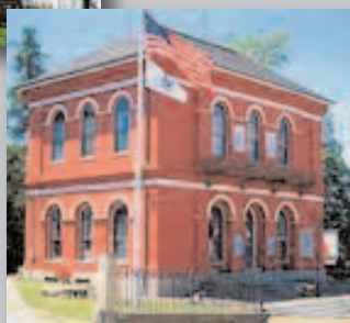
Coast Guard Museum