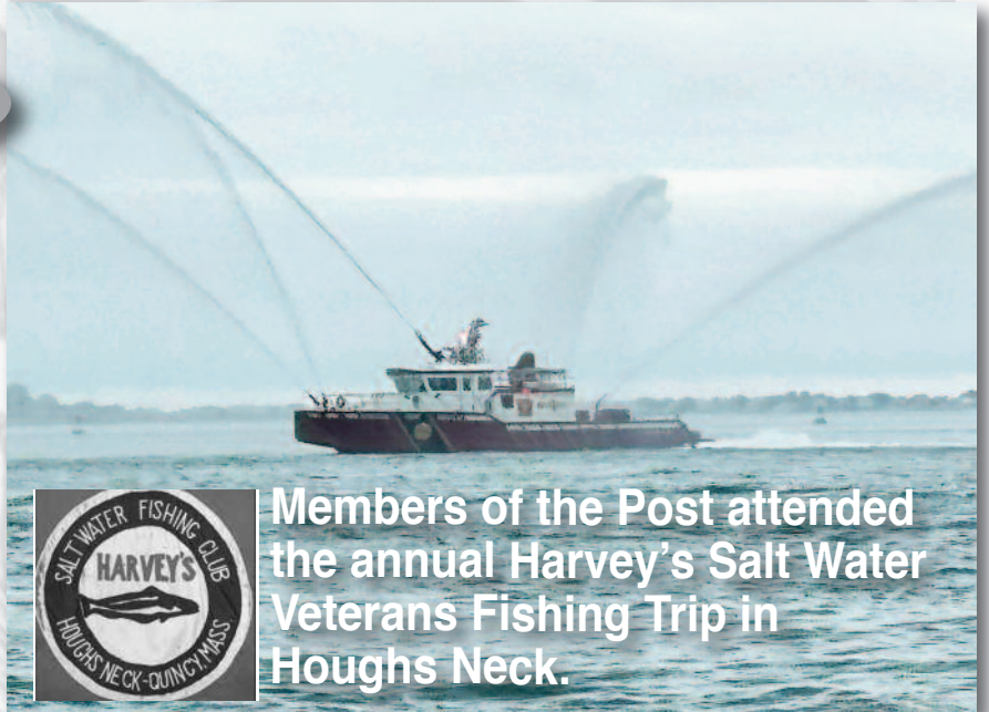
Members of the Post attended the annual Harvey's Salt Water Veterans Fishing Trip in Houghs Neck.